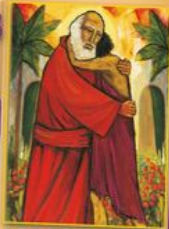
Sunday Gospel Gallery

Look at this Sunday's Gospel picture. What can you see? How do you feel? What does it make you think about?